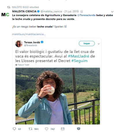
Mostrar este hilo