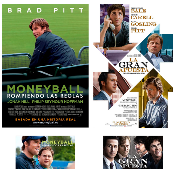
Figure 6: Examples of typographic identity in posters with a change in design

It seems interesting to support the previous data in changes affecting the typographic organisation of the title (the unquestionably preferred element in digital pieces). There is some type of variation along these lines in 30 posters. The vast majority of these changes concern the redistribution of words from one to several lines (especially two) and alignment. In some cases, this new composition affects the rotation ( Tenet ) or the line spacing ( The Wizard of Lies ). While these compositional changes (which could be called macrotypographic) affect a fifth of the strategies (although they are not especially linked to the change in the symmetrical or asymmetrical character of the poster), modifications in the plastic properties of the letter are less common and, when occur, they are almost always minor, mainly affecting the colour (12 cases) or are very subtle formal changes (textures or shading). There are only three surprising cases in which the variation is manifest and affects the font family: The Tale (HBO), Fue la mano de Dios and Green Book (both from Netflix). In Mamá o Papá (HBO) and El muñeco de nieve (Netflix), the changes consist of more subtle formal reinterpretations. Figure 6 shows two examples of Netflix films in which, despite the change in design, the typographic identity remains unchanged.