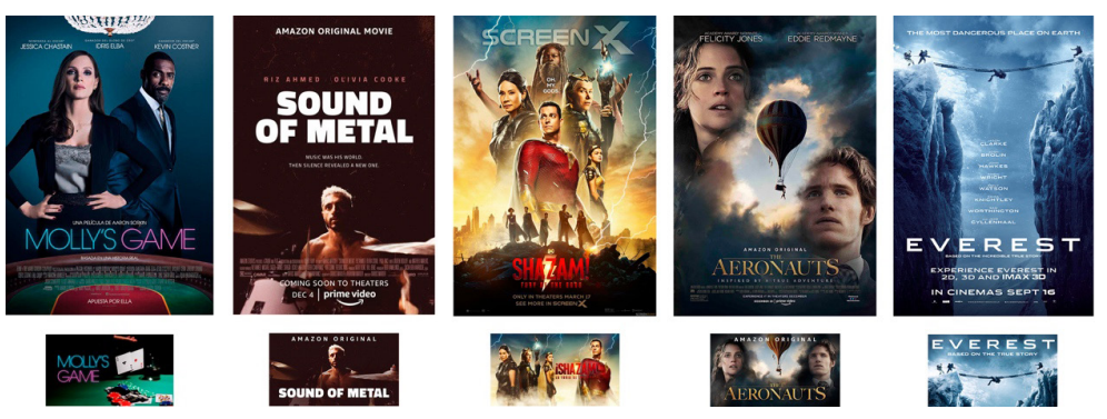
Figure 2: Examples of the five adaptation strategy options

If the strategies developed by the different platforms in the design of the horizontal pieces with respect to the original (vertical) posters are evaluated globally, three main formulas can be seen: respect for the original graphic approach with cropping of the image (implemented in 65 cases, 43% of the total), the change in graphic strategy (47 cases, 31% of the total) and the resizing of the iconic sign (16 cases, 11% of the total). In this last option, the main content is maintained in its entirety although the image's background, be it a texture or a solid colour, is sometimes omitted. Less frequent is the method that uses the same graphic elements with a new composition (reorganisation) of the content, which is used in only six posters (4%). However, 16 other posters can be listed that simultaneously resort to cropping the image and reorganising its content. Figure 2 represents five examples of these methods: from left to right, layout change (Molly's Game, Netflix), resize (Sound of Metal, Prime Video), cropping and recomposition (Shazam, HBO Max), recomposition (The Aeronauts, Prime Video) and cropping (Everest, Prime Video).